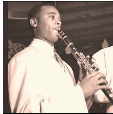
Just Jazz Artist of the Month clarinetist Jimmy Hamilton